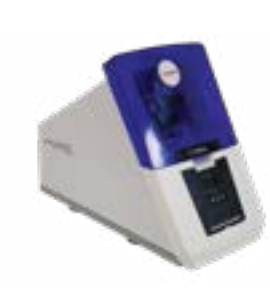
Minilys° for personal use