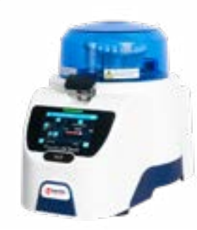
Precellys® 24 Touch Intuitive Tissue Homogenizer