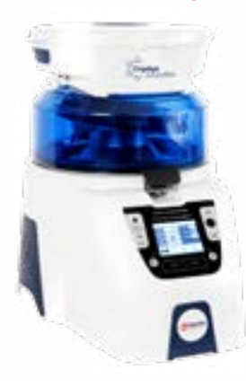
Precellys° Evolution + Cryolys° Evolution combo