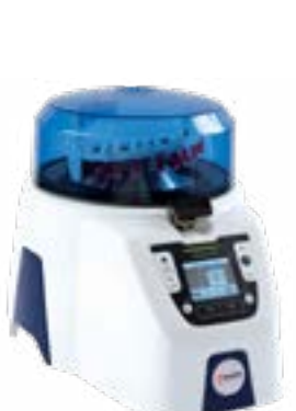
Precellys<sup>®</sup> Evolution Super Homogenizer