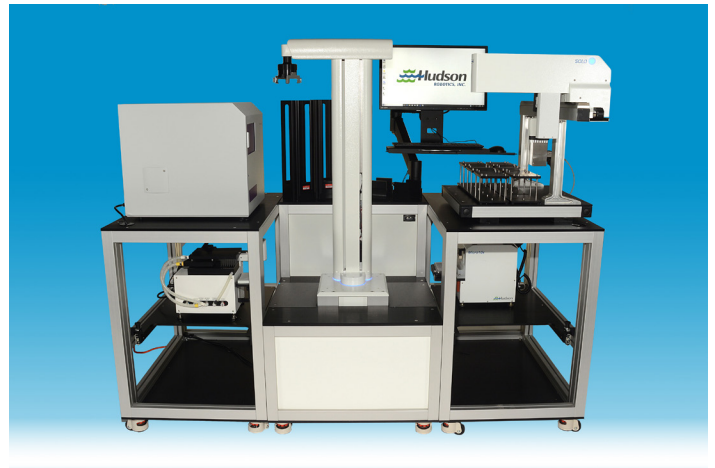
Synthetic Biology Automated Workcell

Our unique combination of ease-of-use and flexibility is reflected in the system's user interface. Advanced users can create complex plug-ins that convert our workstations customized research tools. Alternatively, Hudson-developed software wizards use simple graphics to lead the neophyte through the setup and implementation of the system.